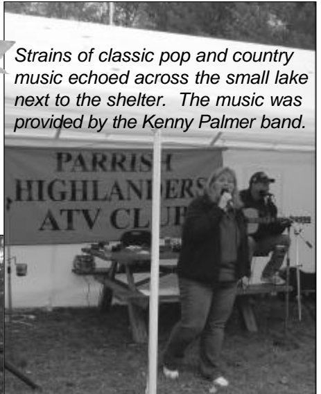
Strains of classic pop and country music echoed across the small lake next to the shelter. The music was provided by the Kenny Palmer band.