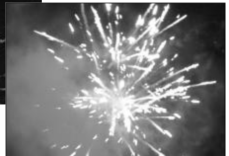
The day ended with some colorful fireworks... ...and a great time was had by all!