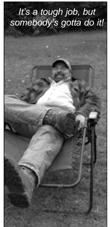
It's a tough job, but somebody's gotta do it!